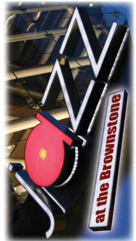
Table TOP Event

Treat yourself, your spouse, your business partners and employees to a classy evening of elegant food, drink, and music! Please watch for your invitation to arrive in the mail and don’t miss the opportunity to attend or sponsor this very special night.