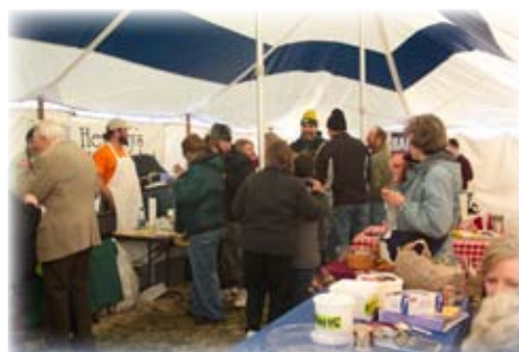
A few of last year's photos

Big thanks to our event sponsors for this year (so far!): Parkview Whitley Hospital, J&J Insurance Solutions, Myers Tison Hockemeyer & McNagny, LLP, Scientific & Regulatory Consultants, Inc. and Columbia City Elks Lodge.