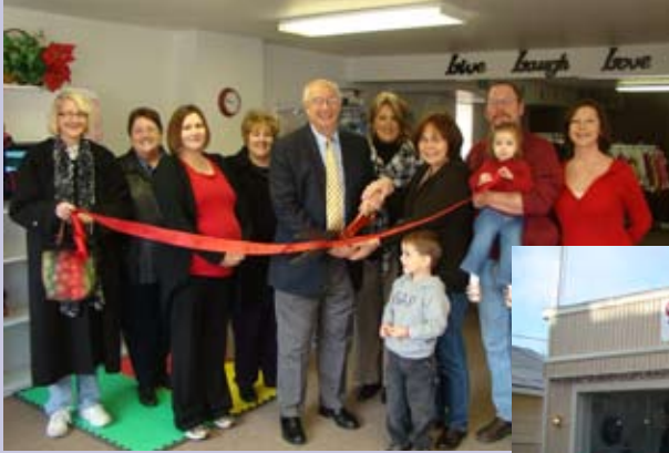
Children's Attic Ribbon Cutting 367A N. Line St., Columbia City, IN